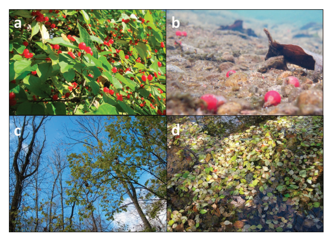
FIG. 1. Lonicera maackii fall fruit production in (a) terrestrial, and (b) stream-run habitats. (c) Freezeresistant leaves in mid-December 2009, and (d) senesced leaf litter in a headwater stream in southwestern Ohio, USA.

Cunn), myrtle wattle (Acacia myrtifolia (Sm.) Willd.), and beaked pincushion tree (Hakea rostrata F. Muell. Ex Meisn.). A Hawaiian study that surveyed more than 60 invasive and native plants found that invasives spent less energy producing leaves and had greater specific leaf area, CO<sub>2</sub> assimilation, and N and P levels than natives did (Baruch and Goldstein 1999). These results also indicate that invasive plants have phenotypic plasticity, which, in turn, may facilitate their success in novel habitats. Invasive plants are commonly thought to grow faster than native weeds do, this trait is usually accompanied by the plant's ability to use resources well, with greater phenotypic and genetic plasticity than natives have (Daehler 2003).