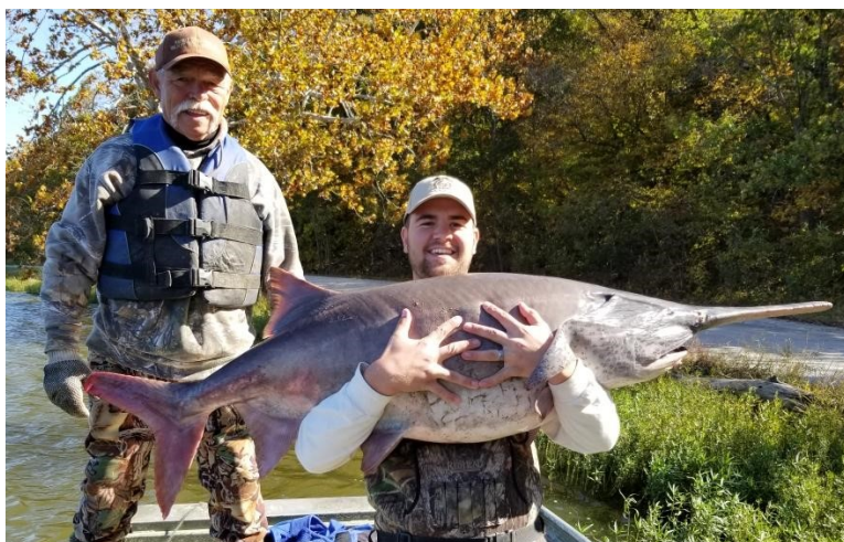
Monster paddlefish continue to show up in the fall sample at Miami State Fishing Lake

Abundance and size structure are both improved for crappie at Miami State Fishing Lake. Catch rate for crappie (species combined) from fall sampling in 2019 was 64 fish/net night and size structure metrics indicated a nearly balanced population with both smaller and larger individuals. Catch rate from fall 2019 sampling for channel catfish was 5 fish/net night, with the majority of the sampled fish occurring in the 11- to 16- inch length range. Catch rate for largemouth bass in 2019 was slightly improved and there is a really good number of largemouth bass occurring in the 15- to 20- inch length range, with 5 largemouth bass sampled that exceeded 20 inches. Miami State Fishing Lake does have a dense stand of curly-leaf pondweed, which is an invasive nuisance plant species. Curly-leaf pondweed grows most during the cooler months with peak density occurring in May. Warmer water temperature causes senescence in curly-leaf pondweed and the stand will be gone in early June.