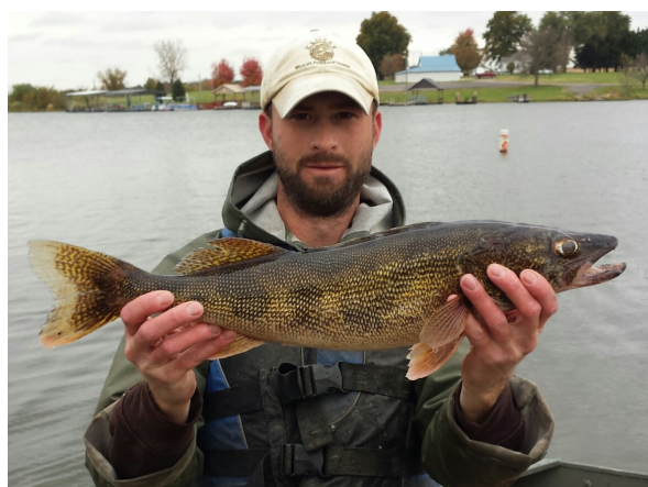
Paola City Lake saugeye