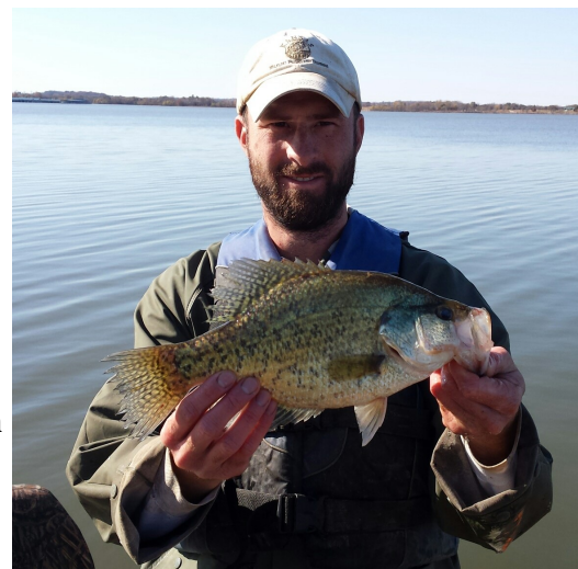
A 13.5 inch Hillsdale crappie

High-water conditions robbed a lot of the angling opportunities in 2019, but a silver lining from all the flooding is that Hillsdale appears poised to provide some good angling opportunities for multiple species in 2020. Angling reports for crappie were really good throughout the winter and that has carried over to the spring. Crappie catch rate from fall 2019 sampling decreased from the previous few years at Hillsdale Reservoir, but size structure of the population remained great with 56% of crappie sampled last fall exceeding 10 inches, which is the minimum length limit for harvest at Hillsdale. Catch rate of walleye was moderate during fall 2019 sampling, but size structure of the population was impressive with 34% walleye sampled in trapnets exceeding 20 inches and 18% exceeding 25 inches! The white bass population fared really well with the high-water conditions as catch rate of white bass smaller than 8 inches was higher than I have ever witnessed. A sign of improved white bass fishing in the future. Catch rate of stock-length channel catfish was 5 fish/net night in the fall 2019. Most of the channel catfish population occurs in the 16- to 24-inch length range.