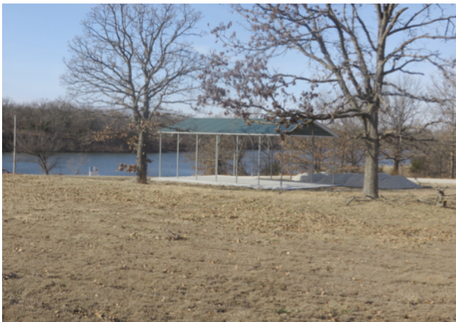
A group shelter was the first segment of the project completed with the CFAP grant at Thayer City Lake.

The City is responsible for 26 percent of the total cost of this project, or $10,400. Part of the grant's match can be provided by use of City labor and equipment. The CFAP grant program is made available to nearly 240 community lakes statewide for development projects that benefit anglers and boaters. Cooperators are required to pay a minimum of 25 percent of development costs. Application for these funds is competitive and is based on needs and benefits of the project, participation in CFAP, and the amount contributed toward the project by the applicant. About $225,000 is available statewide annually.