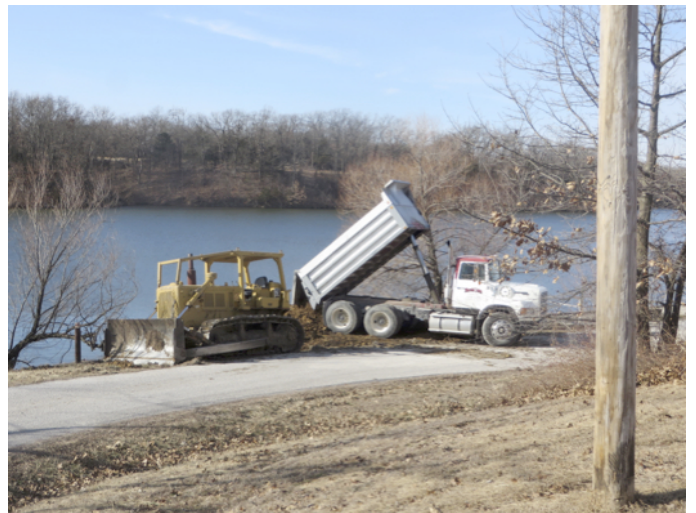
Construction of an earthen fishing pier should improve success of shoreline anglers at Thayer City Lake. This shows the first day of work in constructing the pier.