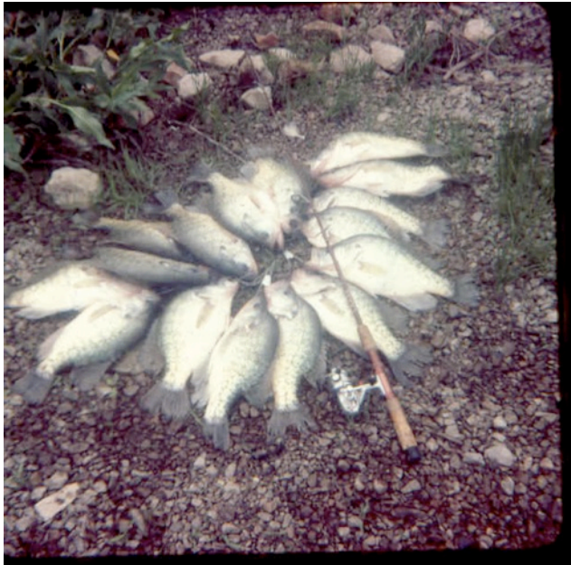
Crappie are one of the best eating fish around, and are abundant in many local lakes.

Bone Creek Lake and some of the larger lakes on the Mined Land Wildlife Area have more quality-size fish to offer. Bone Creek frame-net catch rates are low due to the very clear water, but anglers are commonly reporting catching crappie 12 inches and larger. Bourbon County Lake (Hiattville), usually known for high numbers of smaller fish, has been producing lots quality-sized crappie this spring. Nearby Elk City and Big Hill Reservoirs have crappie populations rated excellent in 2017, and would be good places to go for a chance for some larger fish. If you are willing to drive a couple hours, the best crappie fishing in the state is again at John Redmond Reservoir, located just north of Burlington.