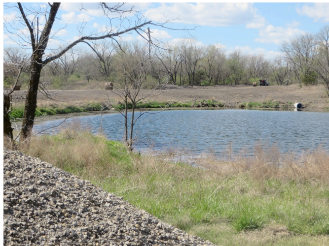
Anglers will enjoy improved shoreline access following KDHE's reclamation project in MLWA Units No. 22-23.

Work yet to be completed includes mulching and crimping, placement of 795 boulders as barricades, and road resurfacing with AB-3 rock.