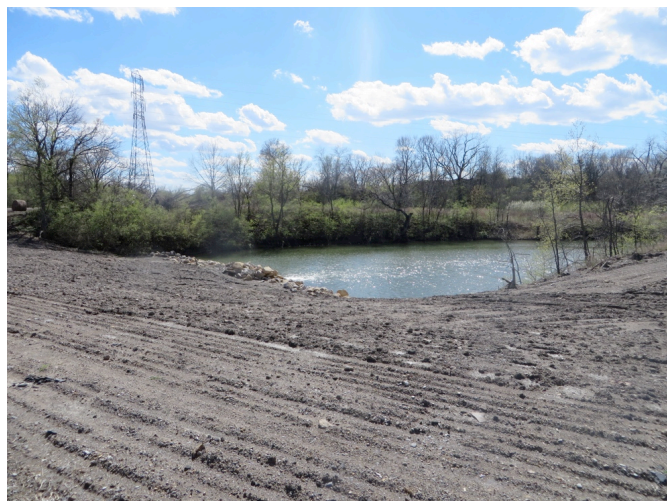
Improved drainage and shoreline access will create a hotspot for channel catfish anglers in Units No. 22-23. Catfish often go on feeding frenzies in areas where heavy runoff enters a water body.

Work yet to be completed includes mulching and crimping, placement of 795 boulders as barricades, and road resurfacing with AB-3 rock.