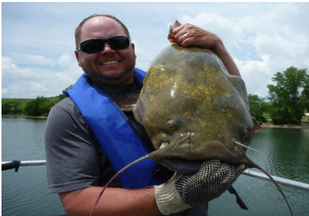
This chunky flathead from Chase SFL was also captured during a largemouth bass electrofishing sample during May 2014.

Most anglers focus on catching the channel catfish. Popular baits include stink baits, dip/punch baits, shad sides or guts, night crawlers, grasshoppers, and cut bait. These baits are effective on channels, but flathead catfish are likely to ignore most of these offerings. While flatheads are occasionally caught on a bait intended for channels, crank bait, slab spoon, or jig they prefer lively baits such as bluegill sunfish, green sunfish, bullheads, crayfish, large wads of night crawlers and occasionally fresh cut bait.