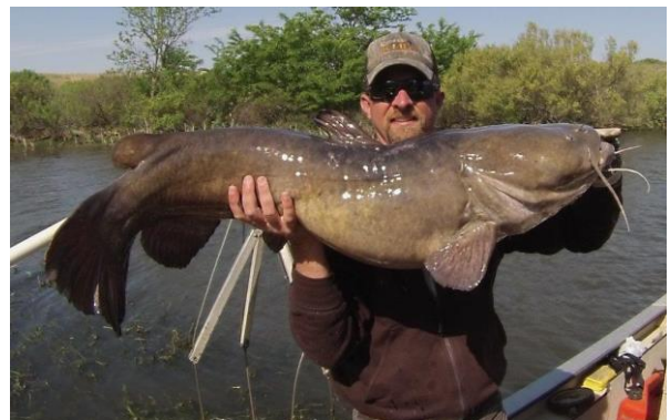
This flathead catfish was captured during a largemouth bass electrofishing sample at Butler SFL during May 2014.

A lake doesn't have to be several thousand acres to produce large-sized fish. Over the past several years, Butler State Fishing Lake and Chase State Fishing Lake (SFL) have held some very nice flathead catfish. While these lakes are managed heavily for channel catfish the flathead catfish have what they need to reach large sizes. Angling pressure is relatively light on the flatheads as the majority of anglers are targeting the channel catfish. This light pressure coupled with an abundance of forage allows for these cats to grow to some impressive proportions.