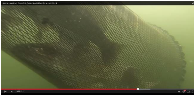
The GoPro camera makes seldom-seen underwater shots of Kansas fishes a reality. The screenshot above shows walleye in a trap net. Click the picture to watch the video.

Blue catfish can be sampled with several different types of fish sampling gear. In addition to gill nets and trap nets, blue catfish can also be sampled using the electrofishing boat. Low pulse electrofishing is used when the blue catfish are targeted. Catfish can be brought up from great distances with the low pulse setting when compared to the much shorter effective distances when scale fish, such as largemouth bass, are collected. One particular sample resulted in an unusually high numbers of blue catfish coming to the surface. The high numbers of blue catfish and near-glass water surface conditions combined for an ideal situation to see the fish. The Electrofishing for Kansas Blue Catfish video can be seen at http://youtu.be/x8nOfJswLBg .