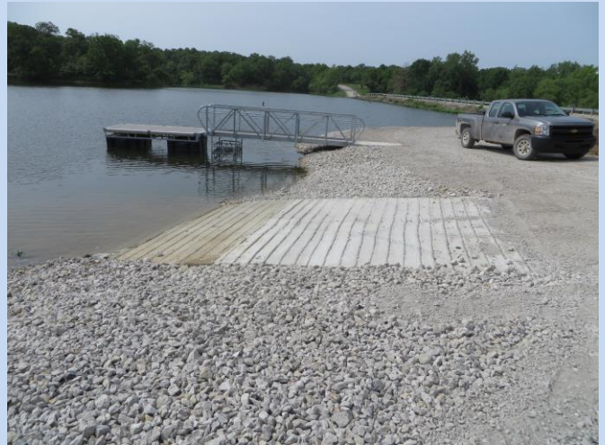
The new boat ramp, courtesy dock, and parking area make boating at Thayer City Lake much safer and convenient. Shoreline access for anglers was also greatly improved.