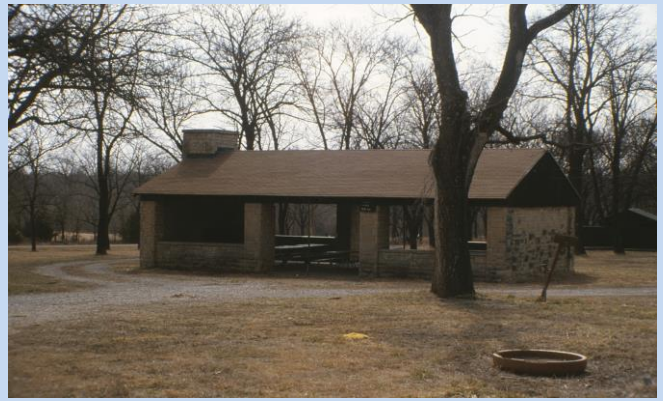
Neosho State Lake is a family-friendly lake with good shoreline access, nice picnic and primitive camp sites, and even a shelter house.

Neosho State Fishing Lake - A total of 103 bass were collected by electrofishing in the 2014 sampling. The catch rate for stock-size fish (8-inch-plus) fell to 81.4 fish/hour, well below the 116.9 bass/hour last year. The lake management objective is to maintain the catch rate near 100 stock-size fish/hour. The mean stock catch rate from 2010-2013 is 111.3 fish/hour. It should be noted that the 2014 sampling was done in high wind conditions, making the sampling more difficult and less effective. Maintaining a substantial bass population is imperative to exert the predation necessary to control abundant shad and sunfish populations at Neosho State Lake. An 18-inch minimum length limit was implemented in 1999 to promote and maintain adequate predation.