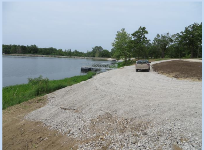
The new fishing dock at Thayer City Lake will provide a nice new access point from the shore, with parking close by.