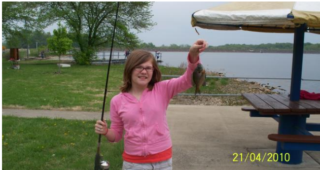
Crawford State Lake has some good shoreline access near the marina and swimming beach area. This young Pittsburg Middle School student is pleased with the bluegill fishing.

Although bass density is low, the quality of the bass fishery remains very good. The percentage of quality-size fish (12-inch-plus) remained high in 2014, with 79 percent of the catch 12 inches or larger. The population continues to have a very high percentage of preferred-size fish, as 51 percent of the catch were 15 inches or larger.