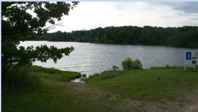
This is Thayer's unusable boat ramp site prior to the access developments. Boaters were forced to launch their boat at the spillway area at the south end of the dam just off the county road. This was a dangerous situation that offered poor boat access.

Total cost of the project is $33,000, of which $24,420 will be paid by KDWPT. The city will provide labor and equipment to complete much of the work. Volunteer labor and equipment has also been utilized