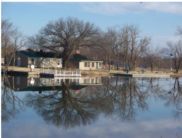
Crawford State Lake has a marina and several floating fishing docks for the shoreline angler.