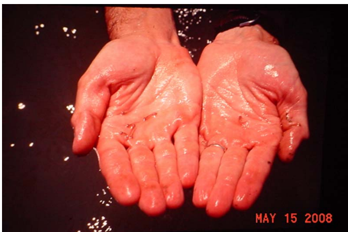
Channel catfish fry from spawning container ready to leave the nest.

The benefits of this project will be monitored through annual fall test netting using monofilament gill nets. Each net is 80 feet long by six feet deep with 10 foot sections of mesh ranging in size from \frac{3}{4} inch to 2 \frac{1}{2} inch to catch all sizes of fish. Twelve nets are placed randomly around the reservoir each October. Further evidence to support reproduction in the artificial spawning containers was documented by a statistically significant increase in the average number of young of the year channel catfish captured by 20 hauls with a 50 foot long bag seine with \frac{1}{4} " mesh. If the project is successful, then it would be more than 31 times more cost efficient to produce fry in a spawning container within the reservoir than to stock fry from a hatchery.