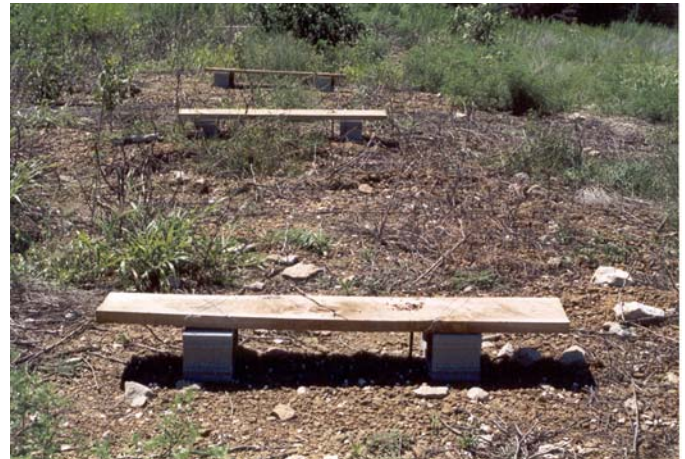
Half-log bass spawning structures at Lyon SFL.

Additionally, 75 half-log structures were added in lotus cove to enhance bass spawning. Ten channel catfish spawning structures were installed. This should be sufficient to supply 1,000 fry per acre. Water willow was planted around the shoreline to provide fish habitat and reduce shoreline erosion.