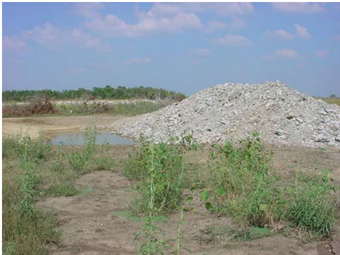
Lyon State Fishing Lake island.

While we were waiting on the lake to refill, 200 cedar and hedge trees were anchored with t-posts or weighted with five gallon buckets of concrete to serve as fish attractors. Three islands were constructed. One was located west of the boat ramp pier, one east of the shelter house pier, and one south of the middle point west shore pier. The islands were pushed up by bulldozer from bottom sediment on the shoreline side. Each island was completely covered in rip-rap to a depth of two feet to prevent erosion. Each island was constructed parallel to shore line on the eight foot contour, and was 50 feet long by 10 feet high and had 2.5:1 slopes.