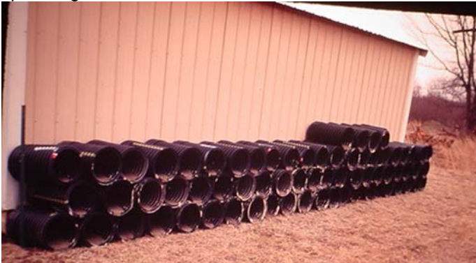
Channel catfish spawning containers ready to be placed.

Since there's a lack of suitable natural spawning habitat in the reservoir, artificial spawning containers were installed to increase reproduction. Seth Way pioneered this technique back in 1926 at the Pratt Fish Hatchery. A three- to four- pound average size female catfish will produce about 15,000 eggs. Males guard the nest and fry until they leave the nest. Eggs hatch in about a week, and it takes three or four more days before the fry are ready to leave the nest. The spawning season in Kansas is long enough to allow each spawning container to be nested in twice.