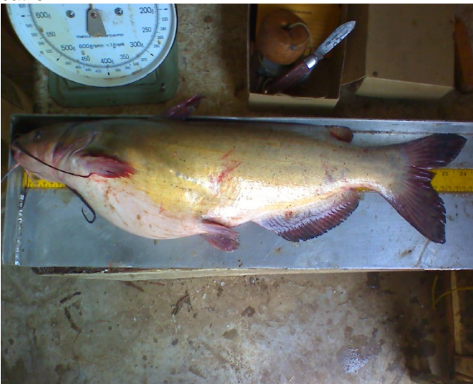
Fat cat from Fall River Reservoir.

Fall River Reservoir appears to be ideally suited for channel catfish. It's a shallow, muddy, windswept lake. Mean depth is just 6.4 feet. Water clarity averages less than 18 inches; but when the wind blows from the south across the two mile reach of the reservoir, the water gets so muddy you can track a coon across it. It's on those days that channel cat fishing is at its' best. The wind blows the bait fish, predominately gizzard shad young of the year, onto the shallow mud flats on the north shore. Throw some shad sides on a hook there and it seems like the lake is full of an endless supply of catfish.