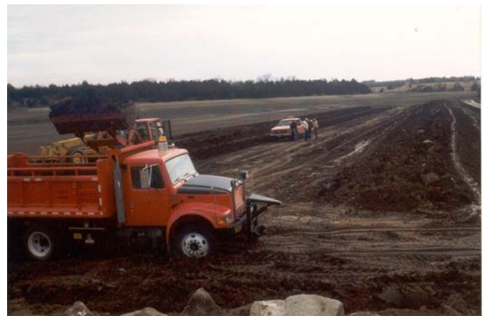
Lyon State Fishing Lake silt removal.

Kansas acquired the lake property in 1931. The Works Progress Administration and Civilian Conservation Corps were responsible for much of the construction. Their craftsmanship is still visible in the native limestone guard posts and inlaid rip-rap on the face of the dam and spillway. The limestone shelter house was constructed in 1951. Other improvements at the lake include a concrete boat ramp, boat loading dock, seven rip-rapped fishing piers, two outhouses, and numerous picnic tables and camping sites.