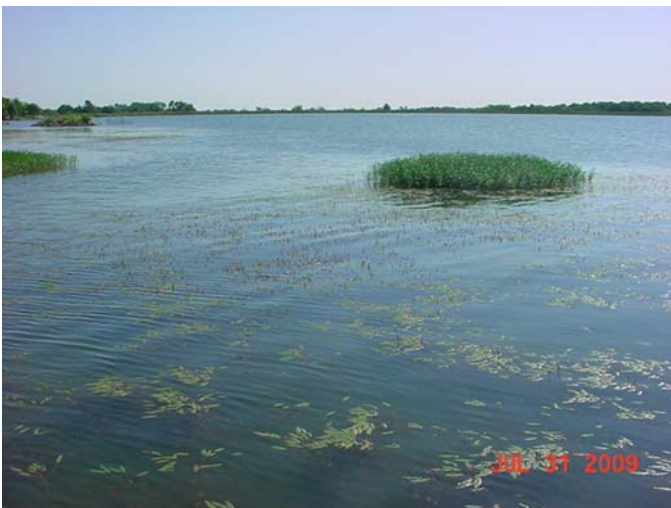
Lyon SFL water willow, American Pond Weed, Sago Pond Weed.

In conclusion, after renovation, Lyon State Fishing Lake has been described as “a farm pond on steroids” and “a bass factory”. This is one fishing opportunity you don't want to miss out on. If you've ever wanted a place to catch lots of bass, this is the lake. It would provide a great place to learn bass fishing techniques. Take a kid fishing here and bring your camera because you won't remember any pictures of children playing video games.