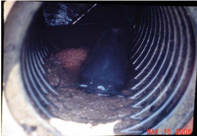
Male channel catfish in spawning container guarding eggs.

The benefits of this project will be monitored through annual fall test netting using monofilament gill nets. Each net is 80 feet long by six feet deep with 10 foot sections of mesh ranging in size from \frac{3}{4} inch to 2 \frac{1}{2} inch to catch all sizes of fish. Twelve nets are placed randomly around the reservoir each October. Further evidence to support reproduction in the artificial spawning containers was documented by a statistically significant increase in the average number of young of the year channel catfish captured by 20 hauls with a 50 foot long bag seine with \frac{1}{4} " mesh. If the project is successful, then it would be more than 31 times more cost efficient to produce fry in a spawning container within the reservoir than to stock fry from a hatchery.