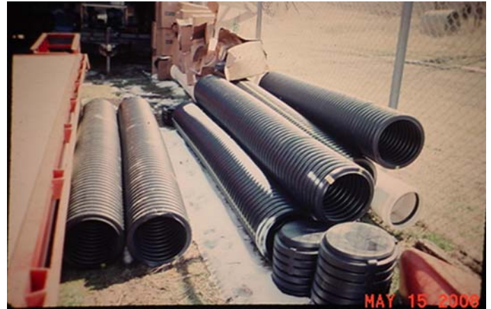
20 feet long sections of corrugate plastic culvert.

Studies have shown that channel catfish will spawn in these containers at any location and any depth in a lake. They have been observed spawning in containers in less than 12 inches of water, and in containers suspended in 30 feet of water. The containers in Fall River Reservoir were placed in four feet of water on gravel substrate with the opening toward deep water. They were placed no closer than 15 feet apart to help keep males from fighting. The location of the containers should be kept secret to prevent unscrupulous anglers from removing the male catfish while guarding the nest.