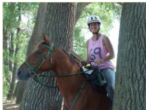
Home to many competitive rides, Kanopolis State Park offers 26 miles of Multi-Use Trails for your enjoyment.

and seemed to be satisfied with facilities provided. Wait until you see what we have to offer now! During the summer of 2001, the campground was completely renovated to provide everything we could think of for equestrian campers. New amenities include a group shelter, two corrals that are each divided into four pens along with 10 smaller pens, a vault toilet, manure bunkers, recycle barrels, three wash bays to wash horses, 14 electric and water sites, 13 electric-only sites, 10 non-utility leveled pads, 4 ADA sites and a primitive camping area where you can