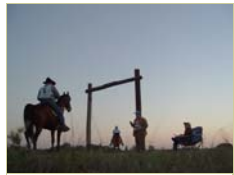
Hitting the trail at Trailhead A—Rockin' K

For the past 10 years or so, horseback riders have been camping at the Rockin' K