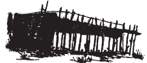
El Cuartelejo Indian Pueblo

Lake Scott SP & WA 101 W Scott Lake Dr. Scott City, KS 67871